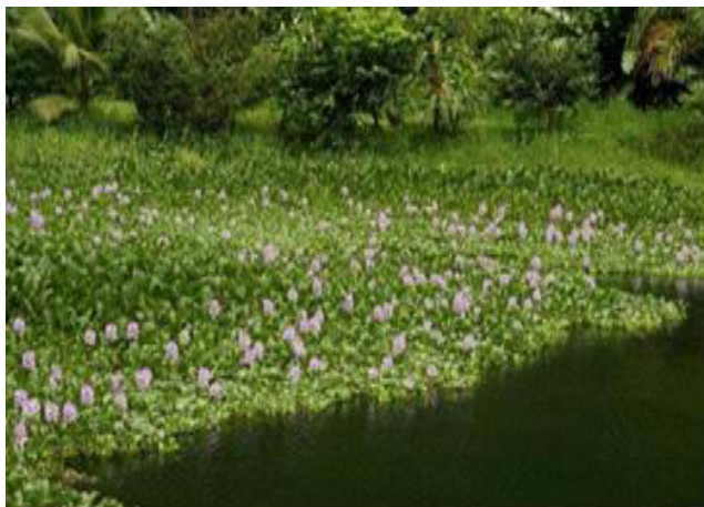
Fig.1. Water Hyacinth Plant in Palakkad Region