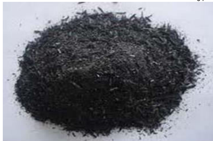
Fig 2. Water Hyacinth Final Products